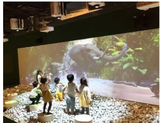
“Indoor Adventure Island DOCODOCO” ~Doronko Jungle (Muddy Jungle)~

A combination of state-of-the-art digital technology and analog-style play brings to life an adventure straight out of a children’s book that children can freely experience with their entire body.